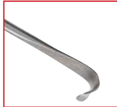
Cushing Vein Retractor 110-312 14" 110-316 16" 110-316XL 18"