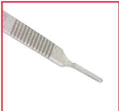
#3 Scalpel Handle 040-070XXL 14" 040-071XXL 16" 040-072XXL 18"

020-044 Container 23" x 11" x 6" 020-045 Basket 21-1/2" x 11" x 4-1/2"