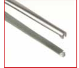
Tissue Forceps 060-054 14" 060-056 16" 060-057 18"