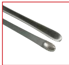
Russian Forceps 060-298 14" 060-299 16" 060-299XL 18"