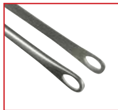
Singley (Tuttle) Forceps 060-306 14" 060-308 16" 060-309 18"