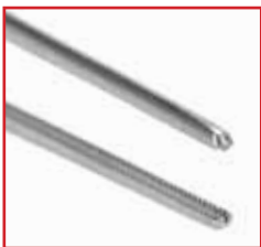
DeBakey Forceps 060-506 14" 060-507 16" 060-508 18"