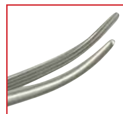
M.D. Anderson Clamp 336-129 14" 336-129XL 16" 336-129XXL 18"