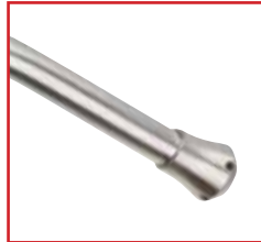
Yankauer Suction 190-620 14" 190-622 16" 190-624 18"